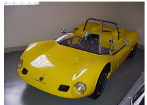
Elva – Porsche

Please forward your reviews, links (which will be also be added to our site) and suggestions.