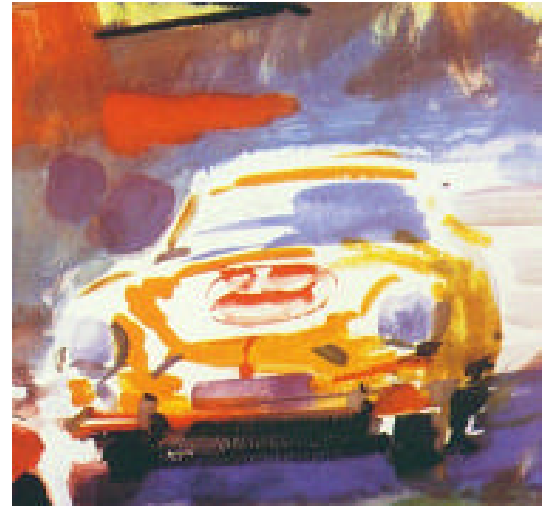
(1956 Le Mans Poster excerpt)