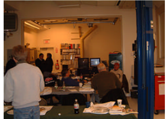
Bentley Publishing's research garage

Fellow Typ 356'ers: Just a heads up that registration for the 2004 East Coast Holiday on September 29 th to October 3 rd in Williamsburg, Virginia is now open and will fill up quickly as happened in Ashville this past year.