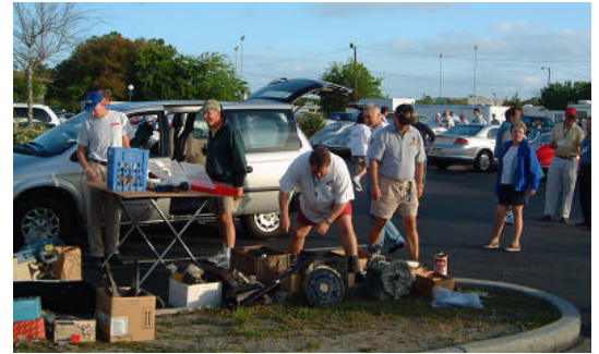
seeking parts at East Coast Holiday 2002