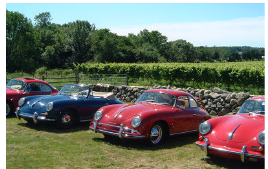
Founder's Day 2003