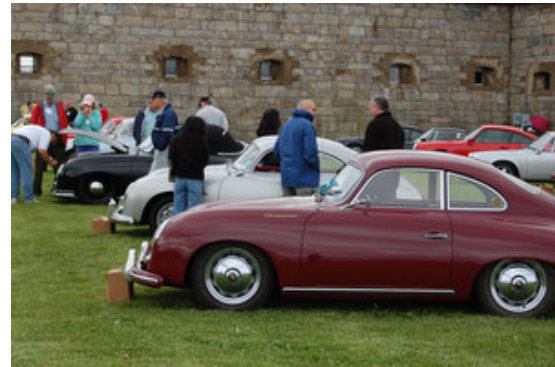
Tom Coughlin's '54 against a fortress background.

Flashback two -- West Brookfield's West Main Street had seen its share of travelers for a couple centuries before the first autos slogged along the route. When Dick's group pulled in the lot was crowded with the other pre-tour groups. We'd all converged in a very timely fashion