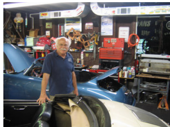
GN Engineering