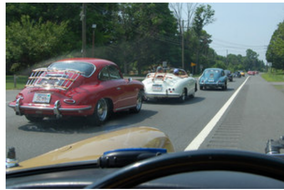
It's all about the driving (and the people and the meals)

Lime Rock is celebrating its 50 th year . They still don't race on Sunday. Tourmeister Crawford pointed out to them the value of appealing to clubs like Typ 356 Northeast. He thought a little controlled speed track-time would appeal to our members. LRP's recent management was convinced. At the gate, in lieu of entry fee we signed some important documents, then through the paddock gate rolled big crowd of 356 and 911's. A bit later we formed on the false grid, got some driver's instructions: "No passing." " The little orange cones are the apex points. " As lunch time ended the BMW drivers' school activity, we rolled onto the course. A pace car, 40 cars and the instructions keep things very safe. At lunch, in the members Chalet, there aren't any complaints – about the track time or the lunch. For me it's been about 40 years since my first LRP visit, the 356's were everywhere then too. None sporting luggage racks though. I suppose that's flashback – five.