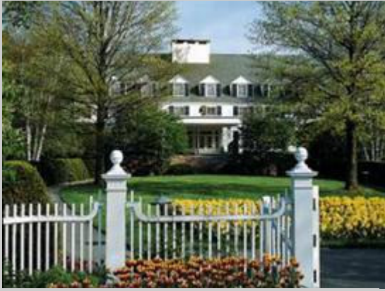
Woodstock Inn & Resort

village of Woodstock, VT. Centrally located just 15 mi. west of Lebanon, NH, and only 14 mi. east of scenic Vermont Rt. 100, Woodstock lies within striking distance of some of the finest driving roads Vermont has to offer.