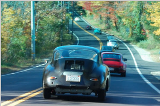
As ever Driving Events top the 2008 agenda