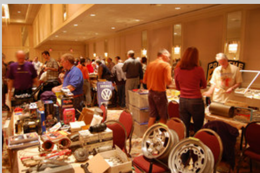
California Winter Break '07

Check the Photo Gallery link above for more photos of most events reported – more photo credits too!