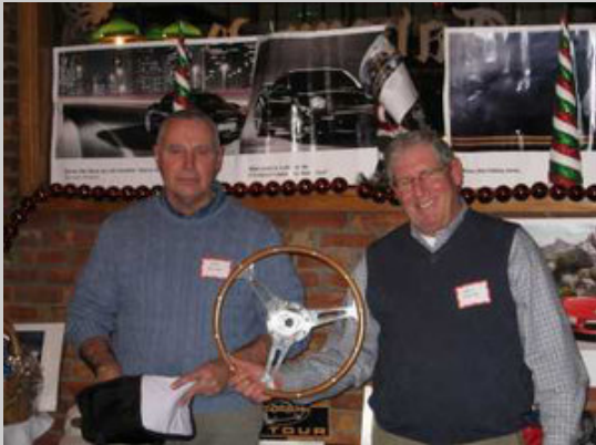
Talk about door prizes!

Remember there's always more images on-line at www.TYP356ne.org