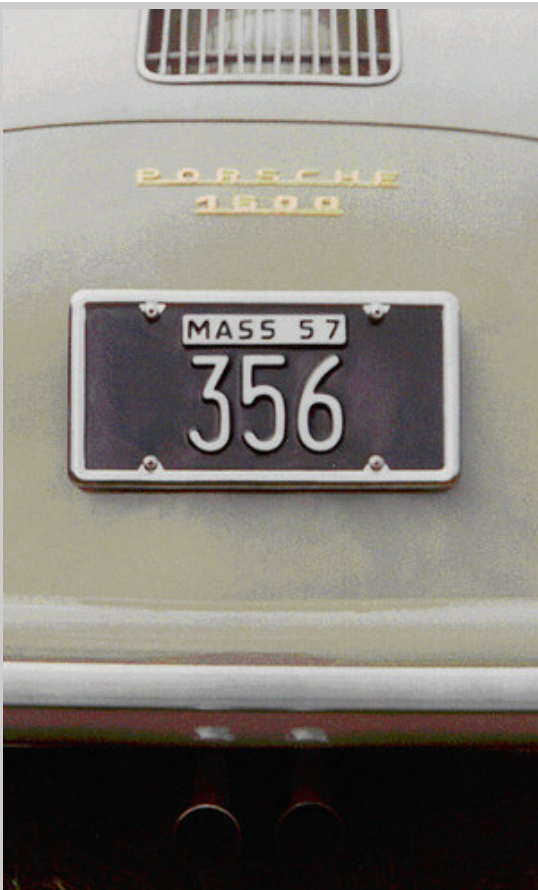
Perhaps the ultimate early Porsche plate