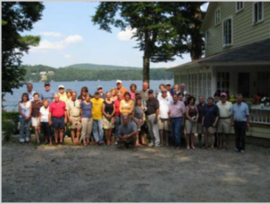
A few of hungry TYP356er's drop by the Wildes back in July.