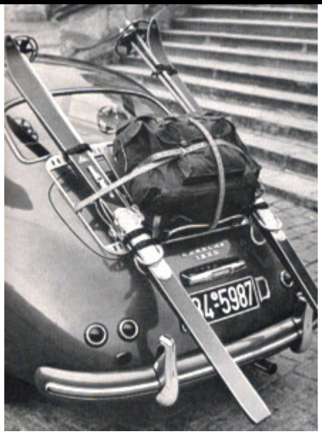
Porsche 356-A Factory accessories (and prices) as shown in 1956 accessory brochure.