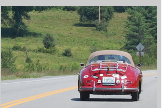
Follow that car! (The multi-stickered Convertible D of president Collins)