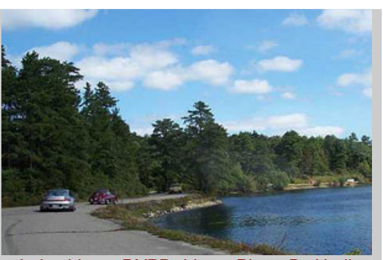
Lakeside on DYPD drive.