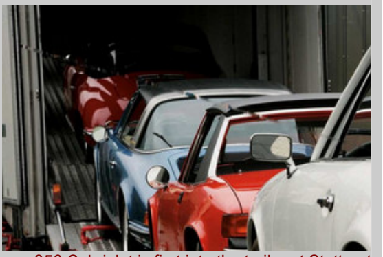
356 Cabriolet is first into the trailer at Stuttgart

"In the last few weeks, we have comprehensively restored all the vehicles and polished