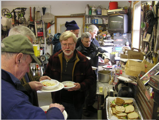
Photos of the Gentz restoration studio

hook and loop sand paper. The grits are P-80, P180 and P-320 with 50 disks in each box of disks. (Note: 3M Hook and Loop is proprietary to 3M).