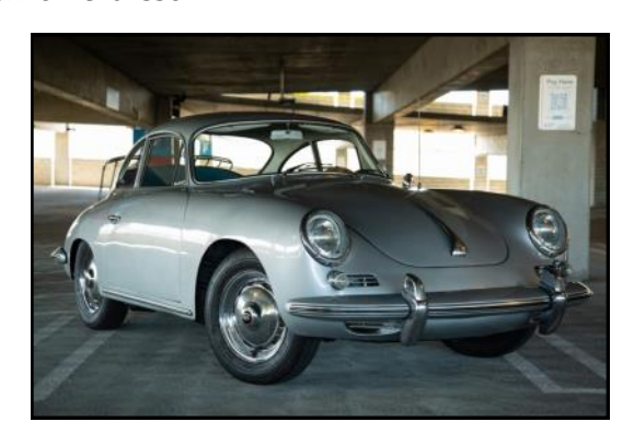
1962 Porsche 356B 1600S Coupe Sold for USD $75,000 on 2/1/25