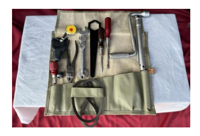
Porsche 356A Tool Kit Sold for USD $3,980 on 1/20/25