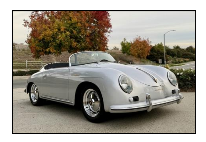
Porsche 356 Speedster Replica by Vintage Speedstersold for USD $38,000 on 1/15/25

More items sold on Bring a Trailer recently