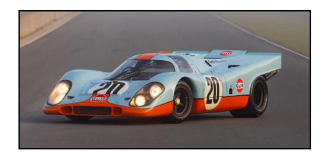
In case you missed it, Jerry Seinfeld's 917 was a no sale at last months Mecom auction with a high bid of $25M. Perhaps Jerry was thinking it was worth close to the $52m recently paid for a 1954 Mercedes-Benz W 196R Stromlinienwagen? Note—the highest ever paid for an automobile was $143M for a Mercedes 300 SLR Uhlenhaut Coupe in 2022.