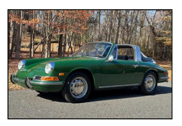
1968 Porsche 912 Soft-Window Targa Sold for USD $95,500 on 11/22/24