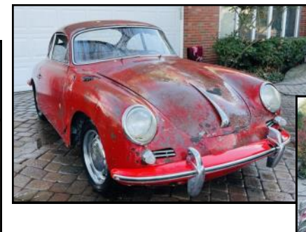
Very rough 1964 Porsche 356C Coupe Project Sold for USD $22,251 on 1/16/25