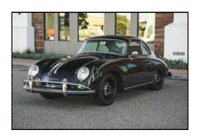
1957 Porsche 356A 1600 Coupe Sold for USD $185,000 on 1/27/25