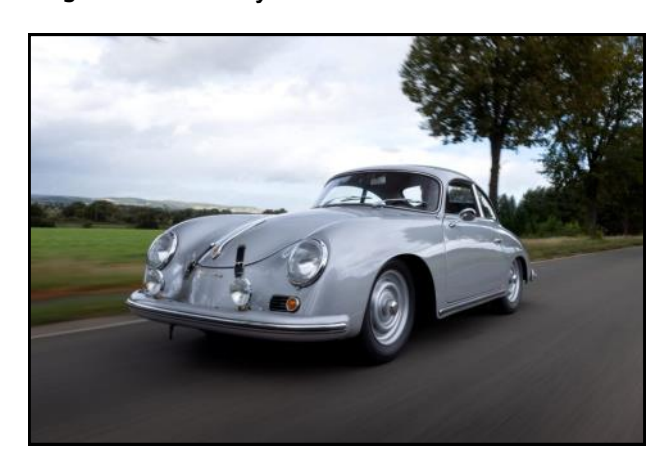
1959 Porsche 356A 1600S Coupe Sold for USD $145,000 on 1/28/25 Car from Germany