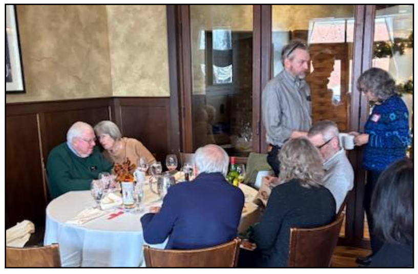
Group shots from the Holiday Party