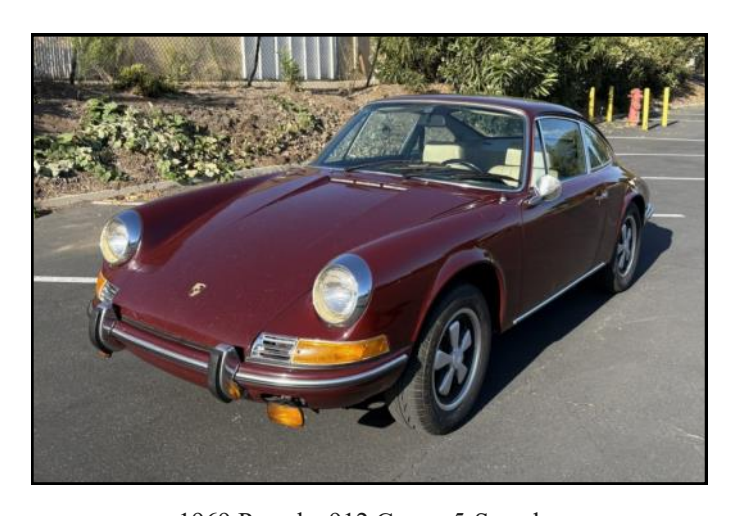
1969 Porsche 912 Coupe 5-Speed Sold for USD $46,000 on 12/9/24