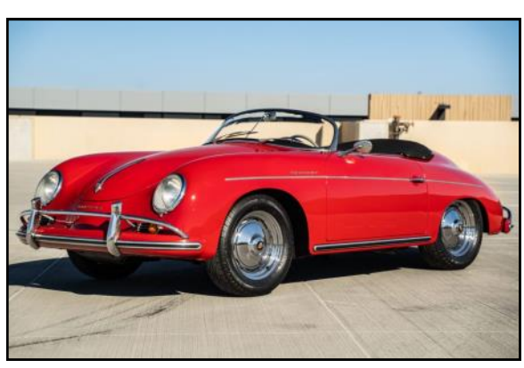
1957 Porsche 356A Speedster Bid to USD $293,777 on 1/25/25