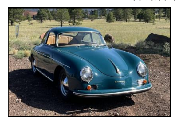
38-Years-Owned 1957 Porsche 356A Sunroof Coupe Sold for USD $75,000 on 1/9/25

Below are a few recent auction results of 356s