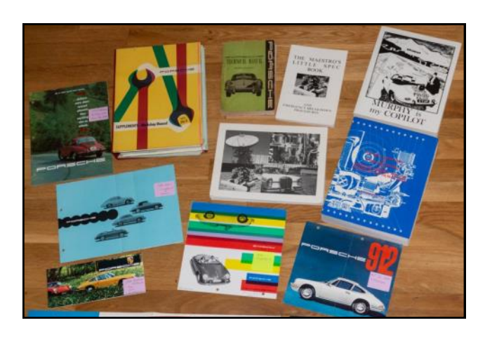
Collection of Porsche Literature Sold for USD $1,100 on 1/9/25