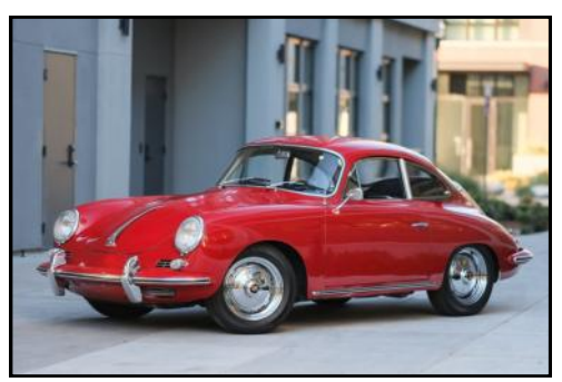
Left - 1962 Porsche 356B Coupe Sold for USD $80,000 on 2/24/25

Right - 1957 Porsche 356A Speedster. Sold for USD $287,777 on 2/14/25