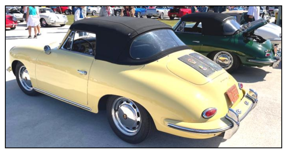
Champagne Yellow and Irish Green C Cabs