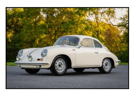
Right - 1964 Porsche 356C Carrera 2 Coupe Sold for USD $465,000 on 2/20/25