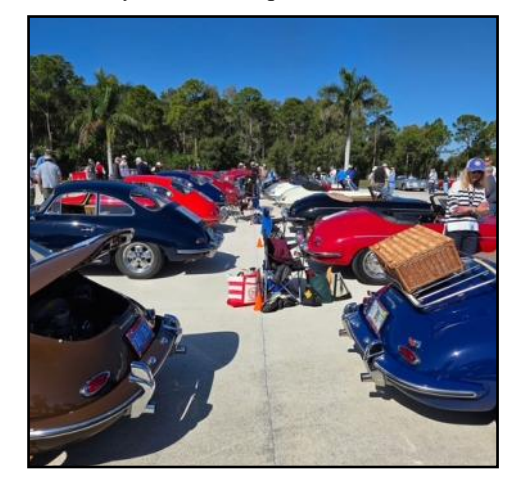
Above and below- group shots