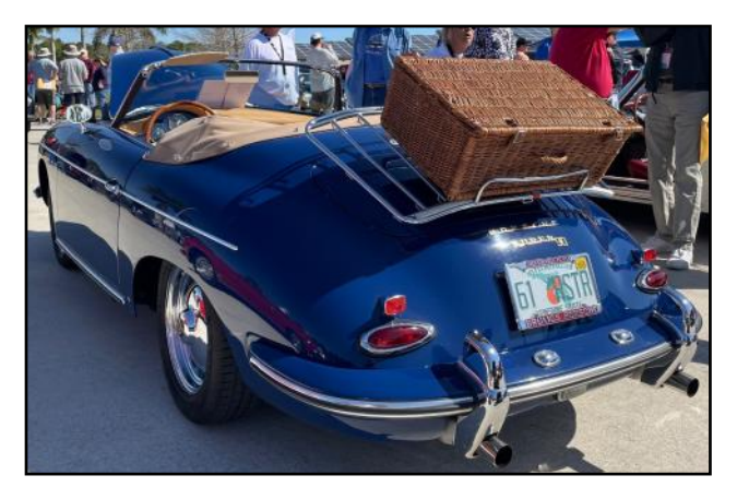
1961 Bali Blue Roadster