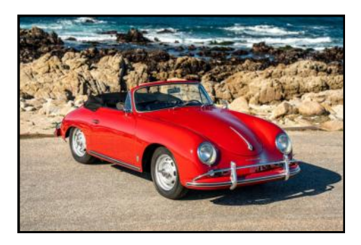
Right - 1958 Porsche 356A 1600S Cabriolet Sold for USD $190,000 on 3/8/25 Notice the Rudge wheels

Left - 45-Years-Owned 1964 Porsche 356SC Coupe Sold for USD $70,356 on 2/10/25