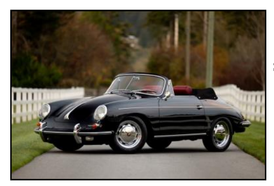
Left -1964 Porsche 356C Cabriolet Sold for USD $169,000 on 3/7/25