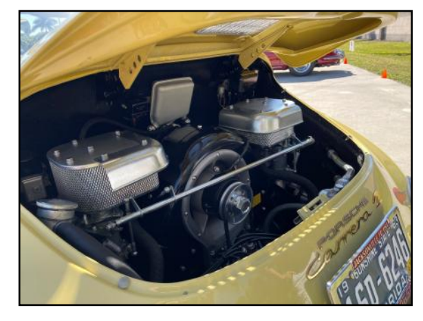
1963 Champagne Yellow Carrera 2 4 Cam