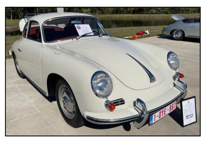
1963 Heron Gray Coupe